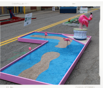
DAY AT THE BEACH