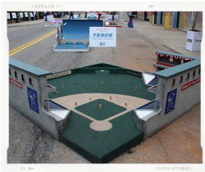
HOME OF THE MUDHENS