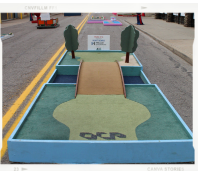
STROLL IN THE PARK