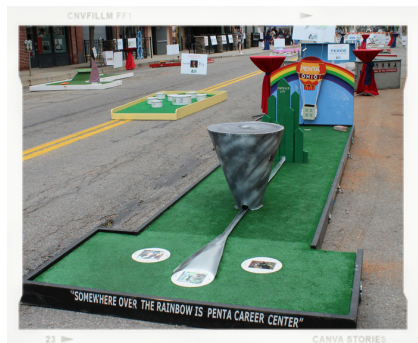
OVER THE RAINBOW